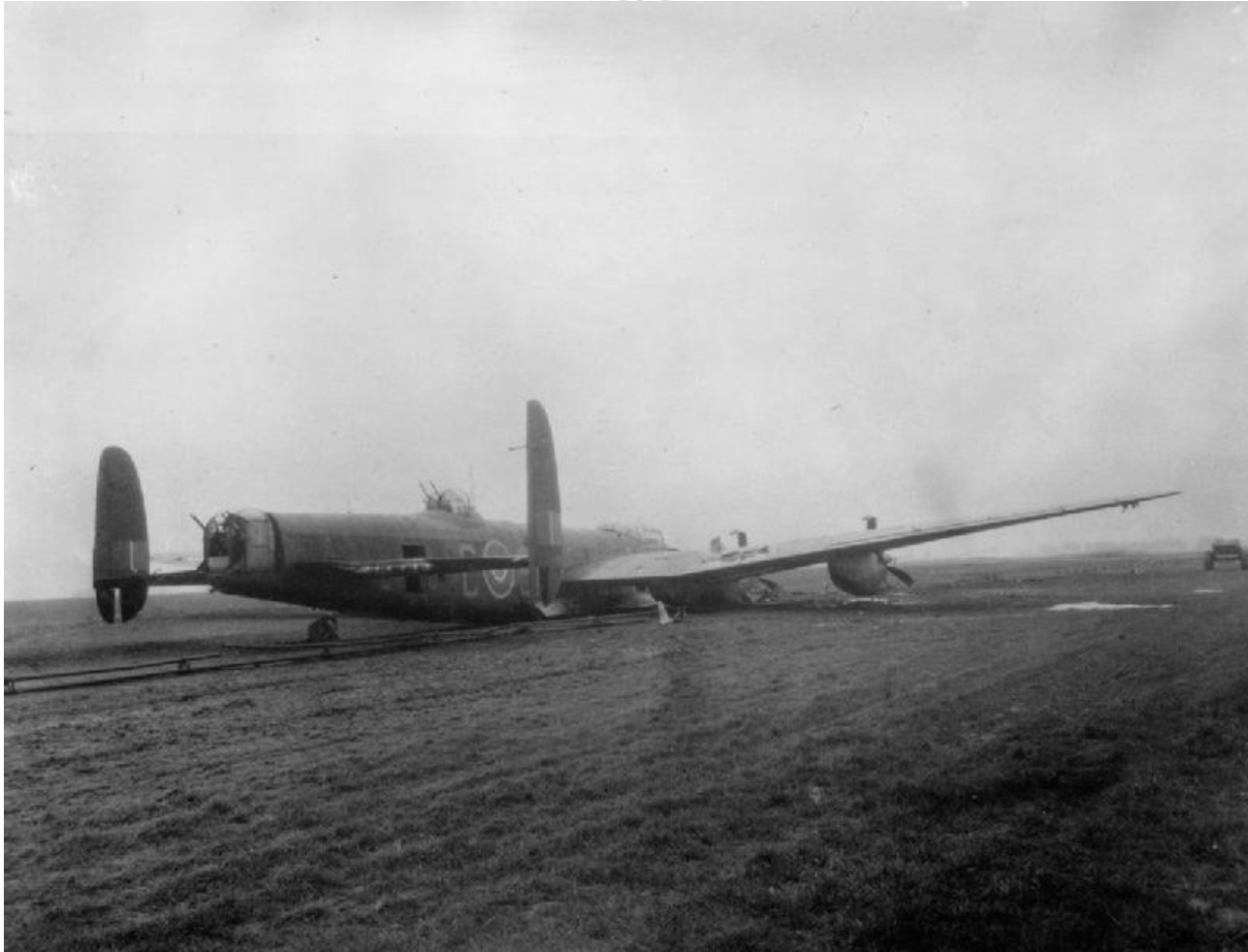
Lancaster which crash-landed with battle damage on its return. The airfield is equipped with FIDO ("Fog Intense Dispersal Operation" or "Fog, Intense Dispersal Of"), hence the pipe running along the ground beneath the Lancaster